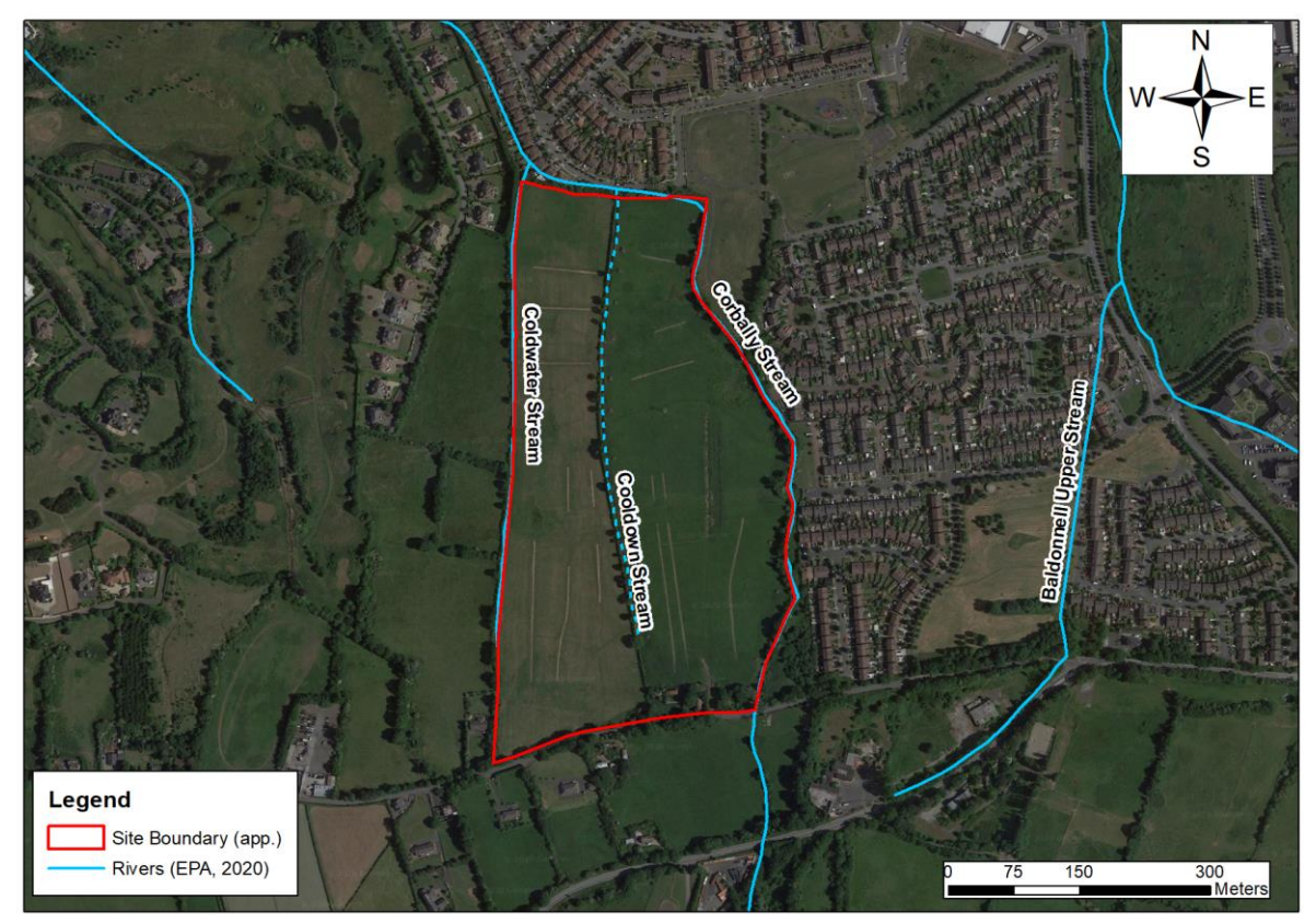
Note: The Cooldown Stream is represented with a dashed line as it is an inactive streamFigure 1.2Site Location in relation to local drainage (local scale)