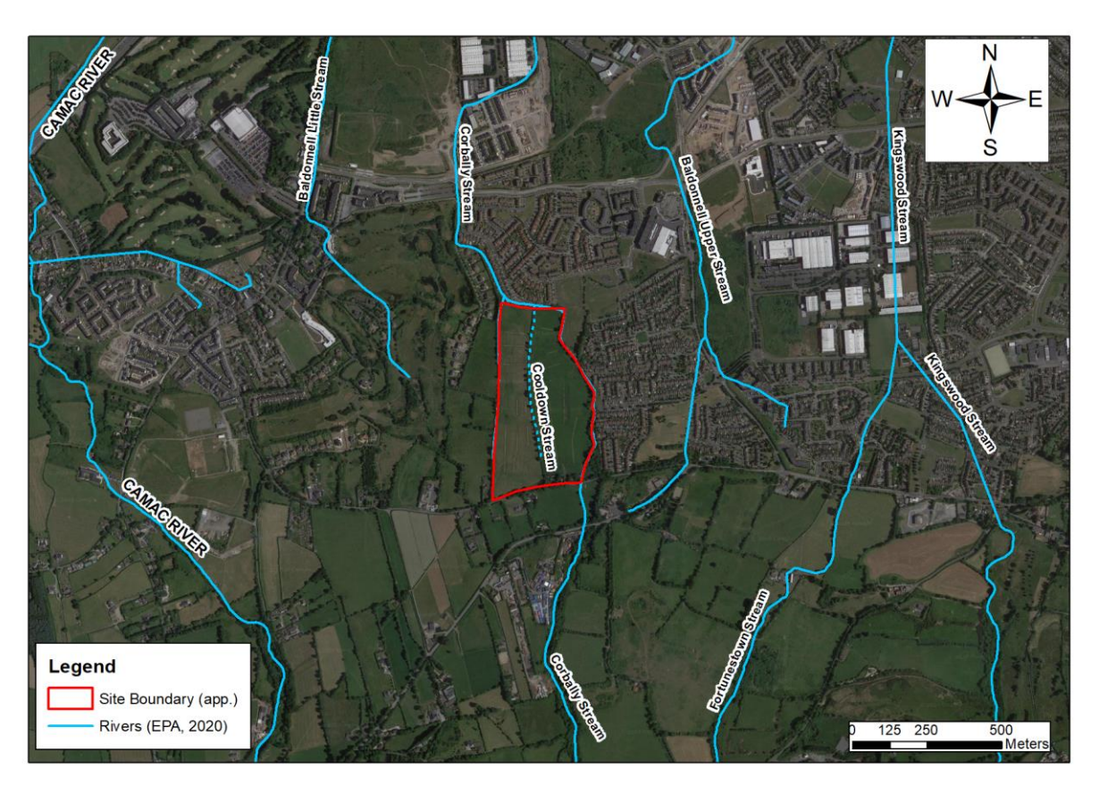
Note: The Cooldown Stream is represented with a dashed line as it is an inactive streamFigure 1.1Site Location in relation to local drainage